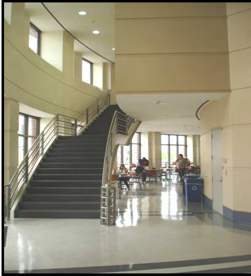
Figure 1: University of Houston, Student Union Building. Duroplex installed over traditional 5/8 in Type X wall board.

Example wall board substrate projects are shown in Figures 1 and 2.