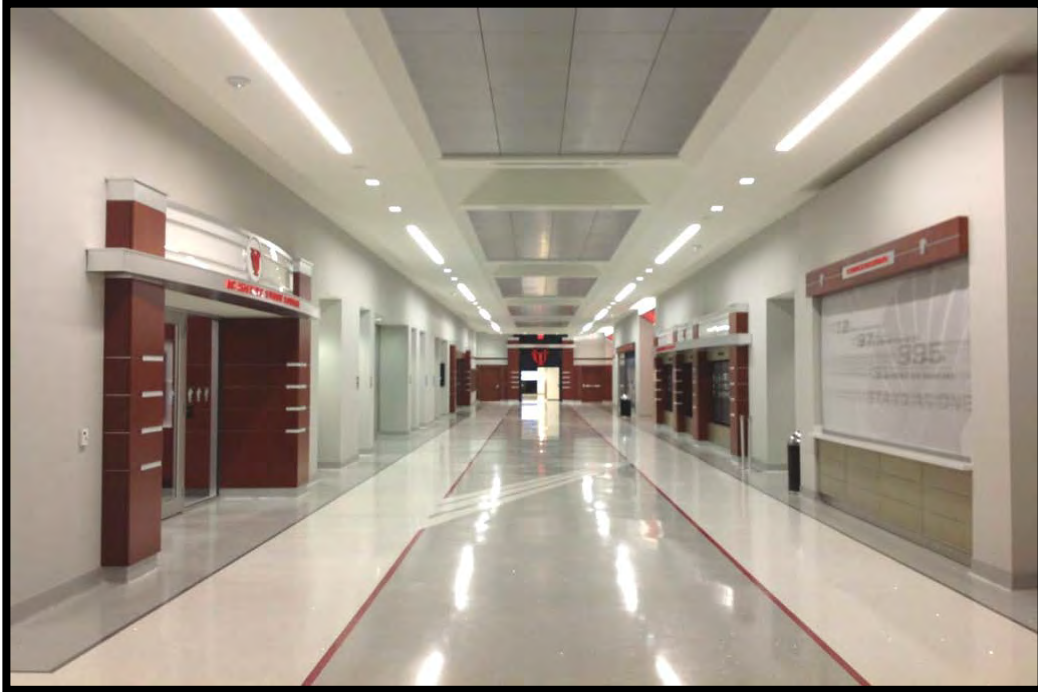
Figure 2: University of Tampa, Athletic Center. Duroplex installed over 5/8 in Type X wallboard from 48 in above floor, and over abuse resistant (AR) board from floor level to 48 in above floor.

Substrate: Concrete Masonry Units (CMU) is another typical substrate that receives Dryvit materials. Often times it is desirable to have the appearance of block disappear so that it is visually indistinguishable between a CMU wall and a drywall partition. Some of the important detail questions that should be considered are: