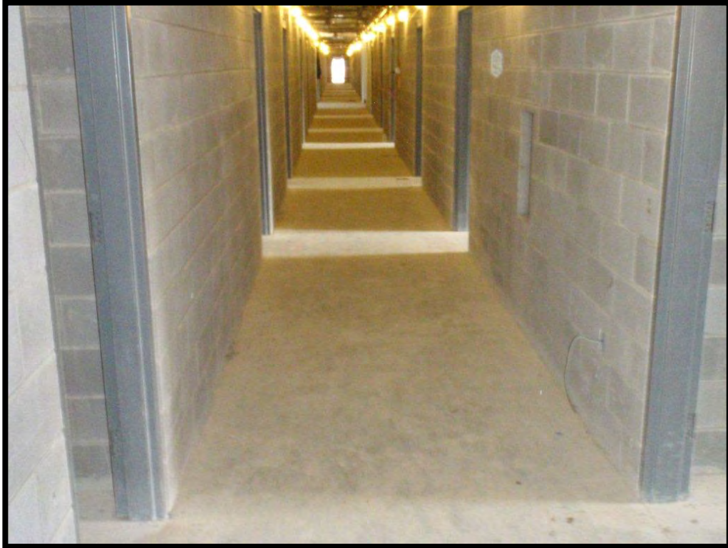
Figure 3: Typical CMU corridor with tooled grout lines. Mason provided block walls with up to 1/4 in tolerance.