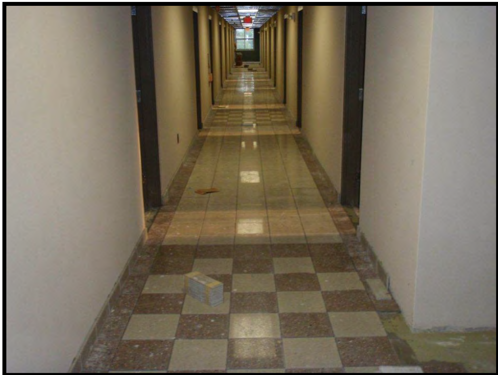
Figure 4: The same corridor from Figure 3 is shown in an almost finished stage. SKIMM was used to float and level the block. Plexture was then applied over SKIMM to finish the walls.