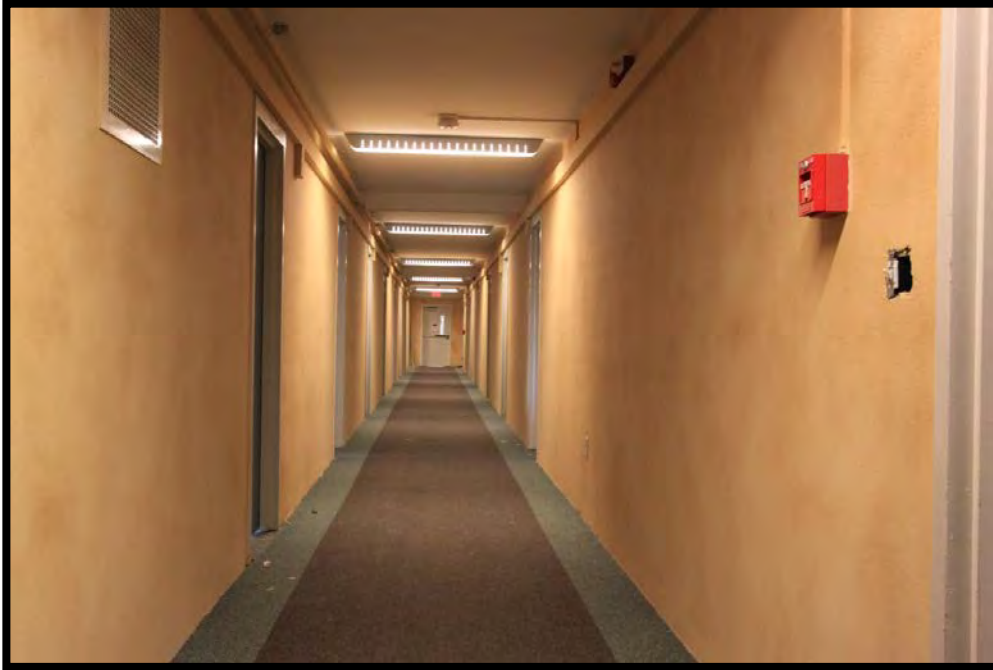
Figure 6: Shown above is the same corridor almost completed. The sequence of application was: Primer, SKIMM, and Duroplex.