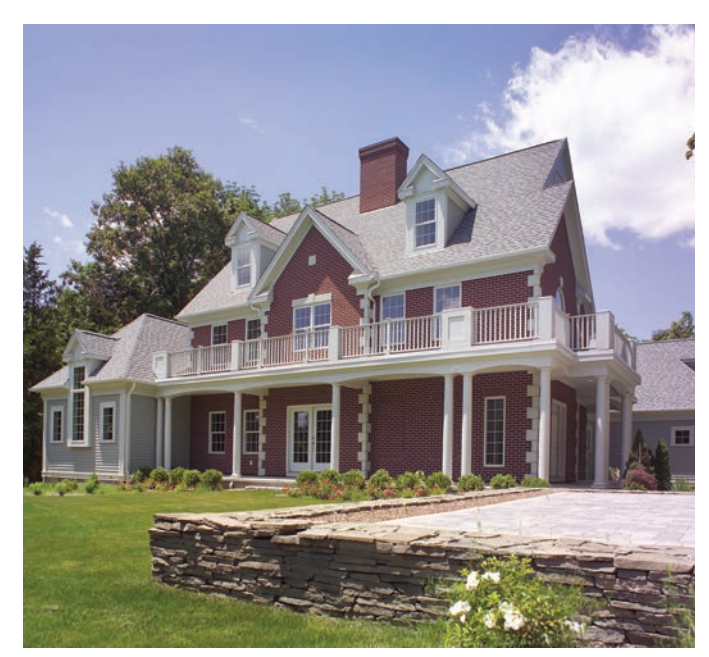
Private Residence | Cumberland, RI

Warranty includes 100% value of labor and materials to replace Dryvit products and wall assembly if damaged.