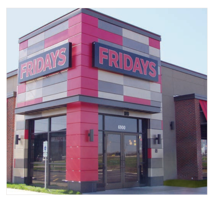
Fridays Restaurant | St. Louis, MO