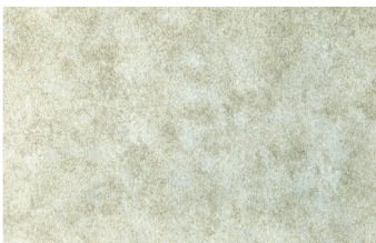
Old World or "Aged" Plaster