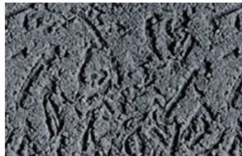
Traditional Plaster Renders