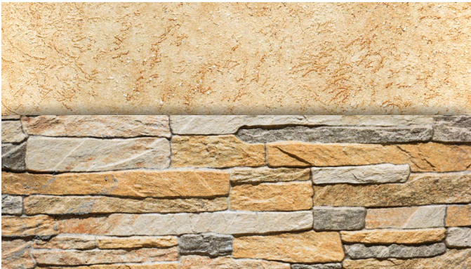
Dryvit Tuscan Glaze Finish with Masonry Veneer